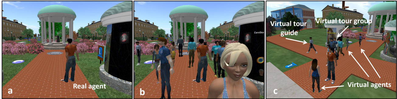
Figure 1: College campus: (a) Many areas in online virtual worlds, such as this college campus in Second Life®, are sparsely inhabited. (b) We present techniques to add virtual agents and perform collision-free autonomous navigation. In this scene, the virtual agents navigate walkways, lead groups, or act as a member of a group. A snapshot from a simulation with 18 virtual agents (wearing blue-shaded shirts) that automatically navigate among human controlled agents (wearing orange shirts). (c) In a different scenario, a virtual tour guide leads virtual agents around the walkways among other virtual and a real agent.

Russell Gayle Dinesh Manocha Department of Computer Science University of North Carolina at Chapel Hill {rgayle,dm}@cs.unc.edu http://gamma.cs.unc.edu/SecondLife