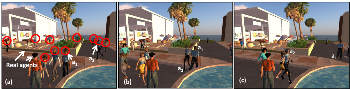
Figure 4: City block: A sequence of still images following the evolution of virtual agents in a small city block. Several virtual citizens (circled in red and wearing shirts in various shades of blue) move around the streets and occasionally stop by the fountain. Agents a_1 and a_2 are identified to demonstrate their avoidance of each other as they cross near the fountain. A human controlled agent (orange) acts as an obstacle and must be avoided. The scene has 18 virtual agents distributed over 2 PCs.