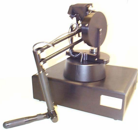
Figure 1: A PHANToM haptic device by SensAble Technologies, Inc..

These haptic devices are capable of providing force feedback to the user to recreate the sense of touch, and some are also high degree-of-freedom 3D input devices. Examples of such haptic devices are the PHANToM of SensAble Technologies (Figure 1) and the SARCOS Dextrous Arm. Many of these devices can be fitted with a pen-like probe, which can be held like a paintbrush when used in simulated 3D painting. This creates many possibilities that could significantly narrow the gap between real 3D painting and simulated 3D painting. Not only can the user apply his brush strokes differently each time, he can also “touch” the surface of the virtual object with the brush. Coupled with visual display, this can undoubtedly provide a very natural user interface for 3D painting.